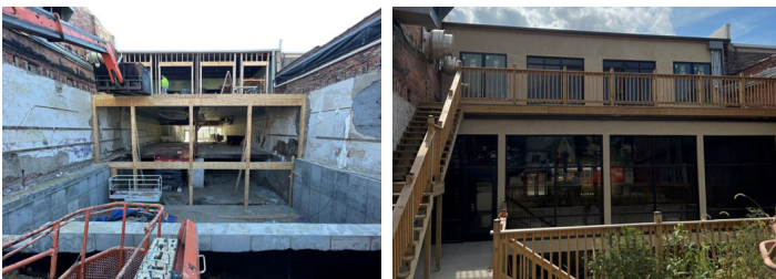
Downtown Ottumwa, Iowa